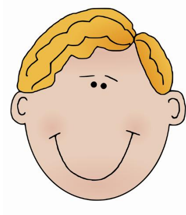
Front of head