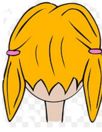
Back of head

The diagram above shows where your child received a bump to the head.